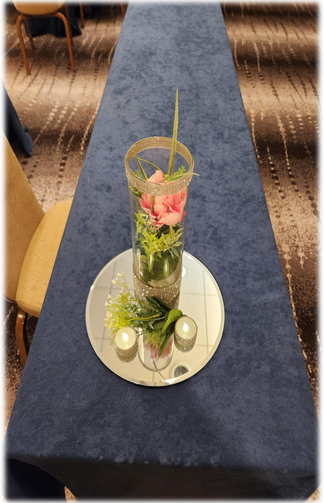
Voilà—The Finished Product