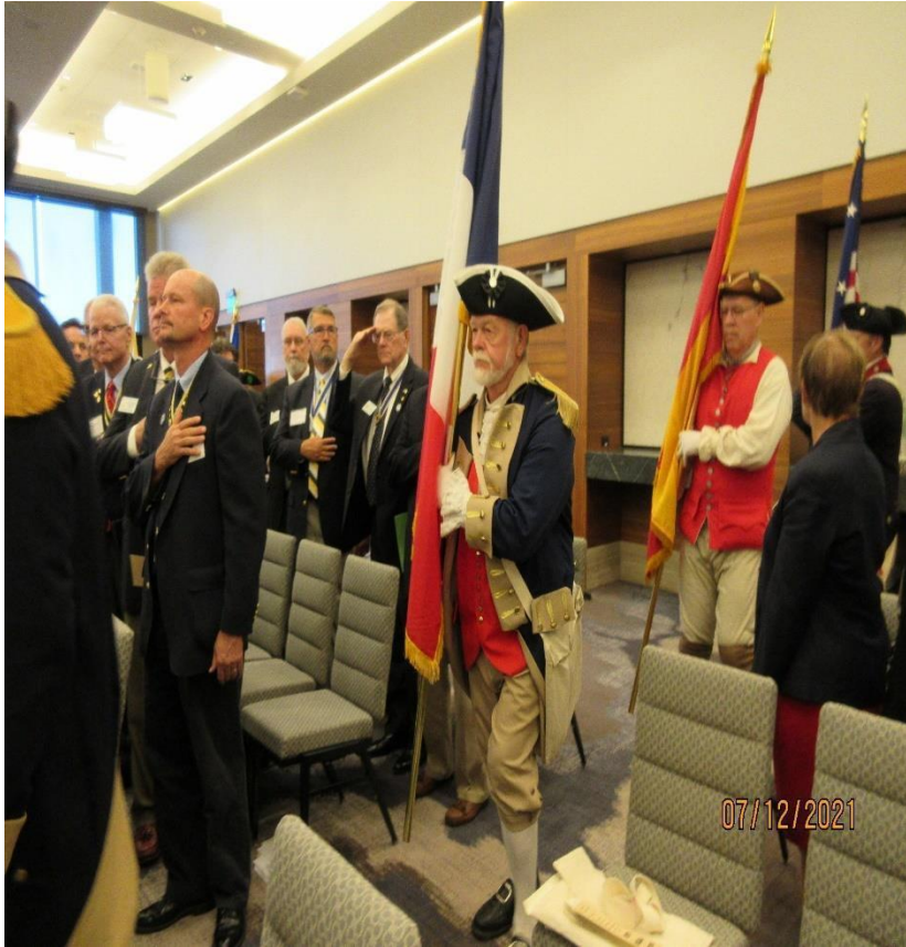
Opening Session of the 131 st Congress at Hyatt Regency on Lake Washington, south of Seattle and next door to Boeing. National and state Colors are presented in a moving ceremony to begin Congress business and events.