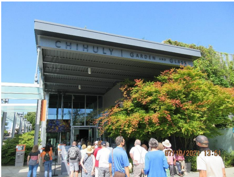
Cultural trips included a visit at the Chihuly Garden and Glass Museum.