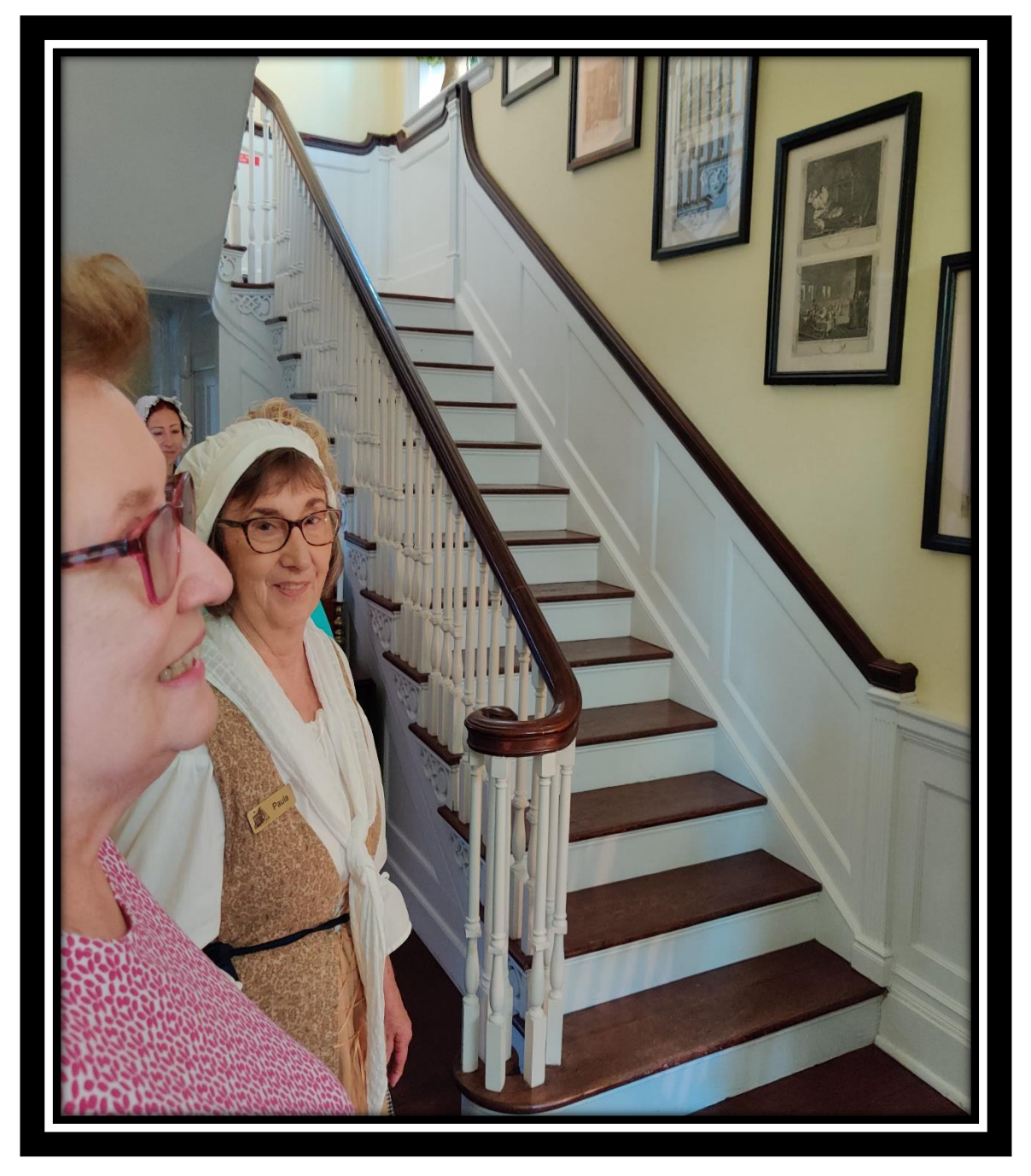
Highlights from Board of Management Meeting in Washington, Pennsylvania August 19-20, 2022