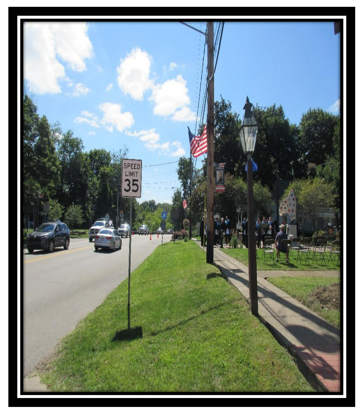
Street-View of Waterford for the Washington Statue Centennial

August 26-28<sup>th,</sup> Waterford, Pennsylvania