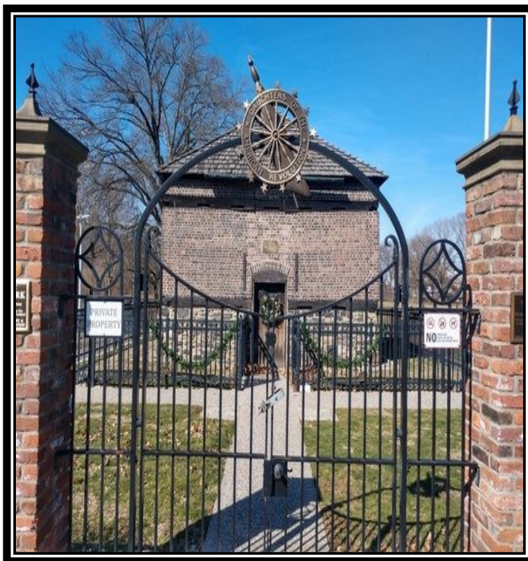
Fort Pitt Blockhouse with DAR Insignia at the top of the Fence